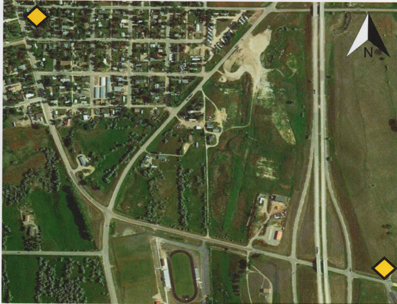
Phase 1 — Parmalee Street to the I-25 Interchange

This project is located on I-25/I-90 BUS and US 16/87 BUS Main Street in Buffalo. The project starts at the I-25 South Buffalo Interchange and continues north through the City of Buffalo to the I-90 North Buffalo Interchange. The length of the project is 3.32 miles.