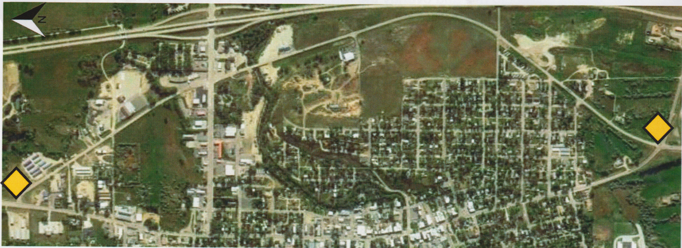
Phase 2 — North/South Bypass (Johnson County ARS)