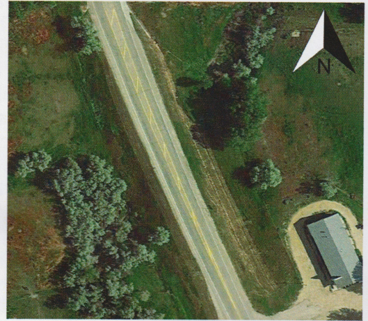
Phase 1 — Cemetery Creek Box Culvert